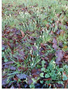
Snowdrops coming up in the churchyard

As we move through these winter days, there are quiet signs of hope in our churchyard, where the first snowdrops are beginning to appear. These small white flowers, so easily missed, remind us that new life is already stirring beneath the cold ground. May these delicate blooms lift our spirits this week and encourage us to notice God's gentle presence and faithfulness in even the smallest signs around us. There is much to look forward to, with many updates to come as we move through a busy and life-filled season in our church community.